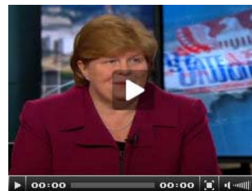
US bank bonus season White House Economic Adviser Christina Romer talks to CNN ahead of bank bonus week in the US.